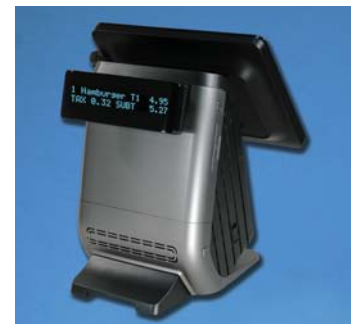
Optional Integrated VFD Customer Display