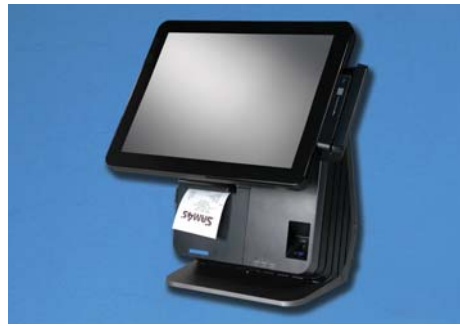
Card Reader / Printer / Fingerprint Reader