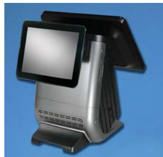
Optional Integrated 9.7" LCD Customer Display