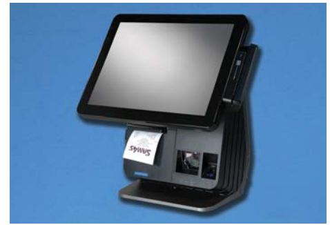
Card Reader / Printer / Scanner + Fingerprint Reader