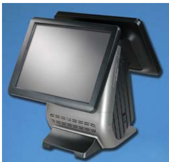
Optional Integrated 15" LCD Customer Display