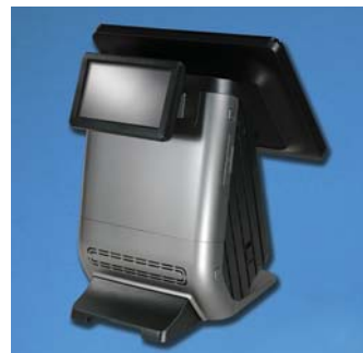
Optional Integrated 7" LCD Customer Display